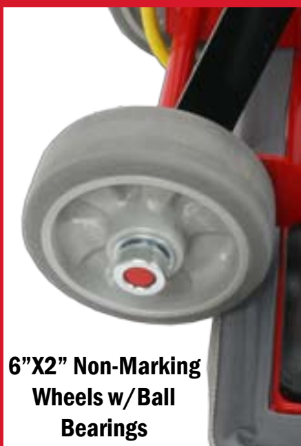
6"X2" Non-Marking Wheels w/ Ball Bearings