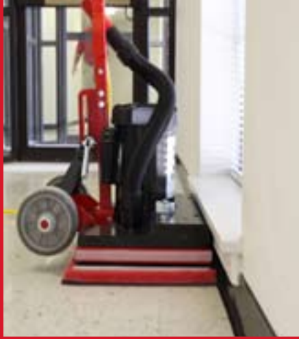
Edges and Doorways