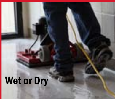
Wet or Dry