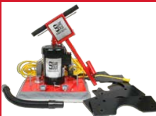
Easy to Transport