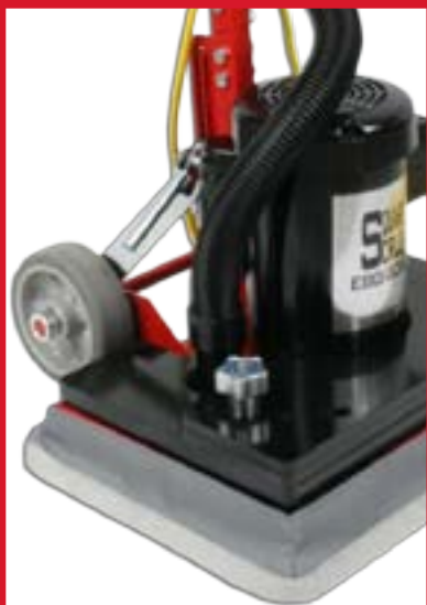
Dust Containment Kit