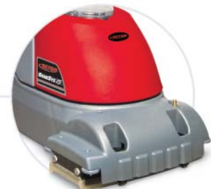
4-sided squeegee containment and powerful vacuum motor will leave floor dry while making tight turns

The Betco GeneSys™ 15 is the next generation cleaning system. The closed loop solution design ensures that only clean water is applied to the surface while dirt and contaminants are extracted by a high power vacuum motor. Testing shows that the Betco GeneSys 15 removes 36 times more organic matter than using a mop and bucket while cleaning 4 times faster. Even more exciting is the availability of optional cleaning tools that allow the closed loop cleaning system to be used on carpet, upholstery, vertical surfaces, and many other hard to clean areas. The cleaning tools create 4 machines in ONE! Experience the next generation in small area cleaning, Betco GeneSys 15!