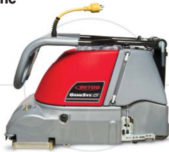
Solution level gauge, adjustable head pressure, variable solution control and easy, compact storage