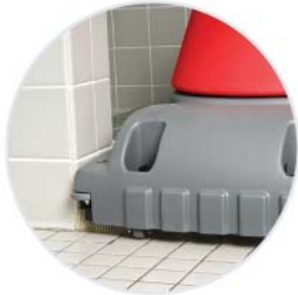
Offset brush for superior edge cleaning against vertical surfaces